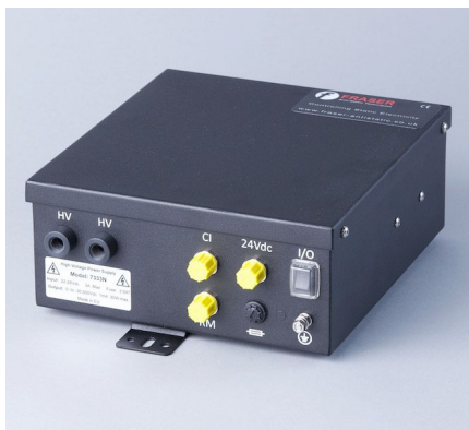
7333 (30kV) Generator