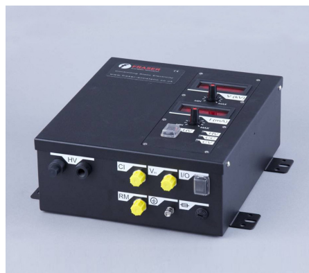
7360 (30kV) and 7560 (50kV) Generator

Please see separate datasheets for generator specifications etc.